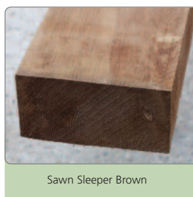
Sawn Sleeper Brown