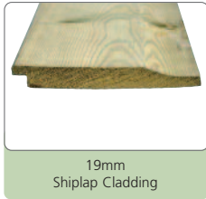
19mm Shiplap Cladding