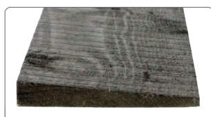
Essex Black Barn Weatherboard/Cladding