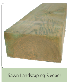
Sawn Landscaping Sleeper