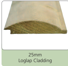
25mm Loglap Cladding