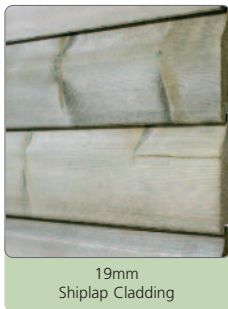
19mm Shiplap Cladding