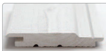
Pre-painted White - secret fix