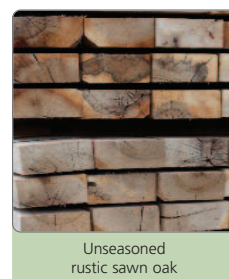
Unseasoned rustic sawn oak