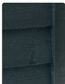
Pre-painted Black Cladding Rebated