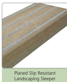
Planed Slip Resistant Landscaping Sleeper