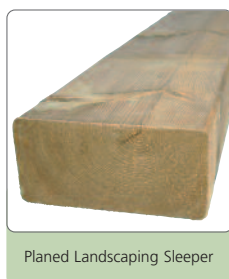
Planed Landscaping Sleeper