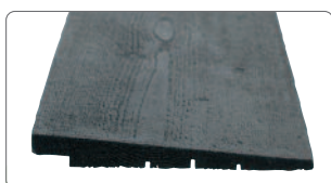
Pre-painted Black Cladding Rebated