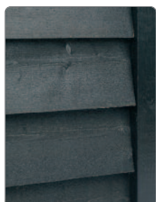
Essex Black Barn Weatherboard/Cladding