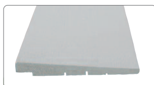
Pre-painted White Cladding Rebated