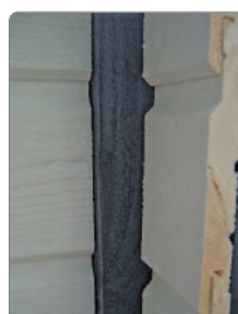
Pre-painted White Cladding Secret Fix