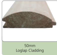
50mm Loglap Cladding