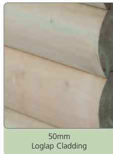
50mm Loglap Cladding