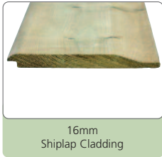
16mm Shiplap Cladding